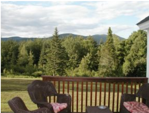
Rear Deck & Yard