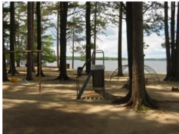
Play Area & BEACH