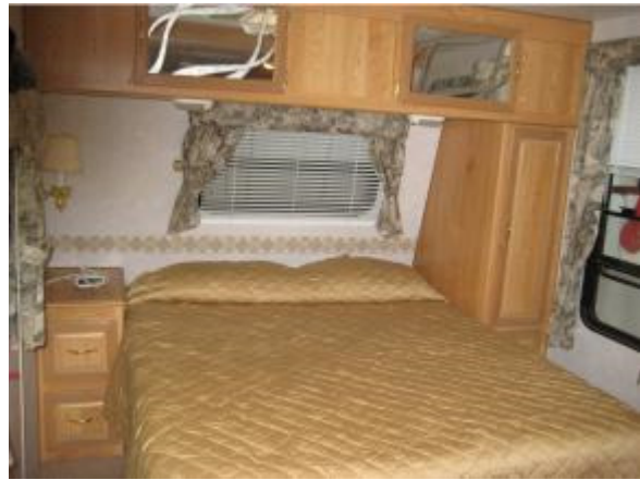
Queen Bed in "Master"