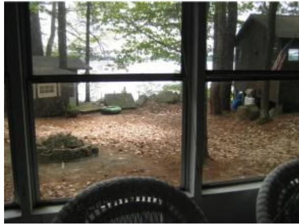
Porch Overlooks Lake