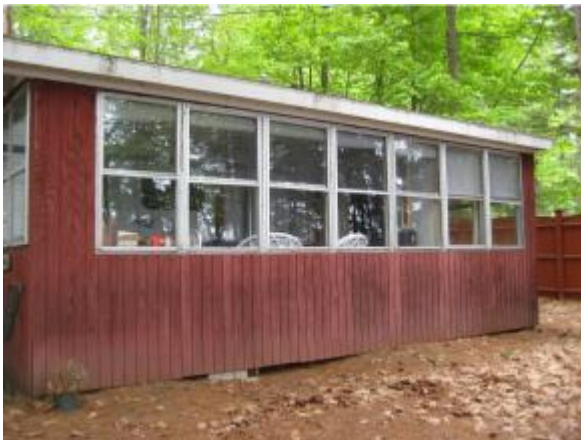
exterior of Porch