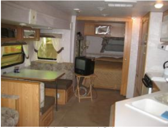
Kitchen/Family towards Bedroom