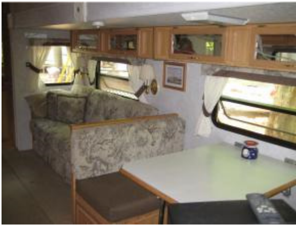
Dining Area converts to a Bed!