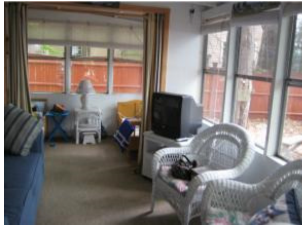
with lots of light & fresh air