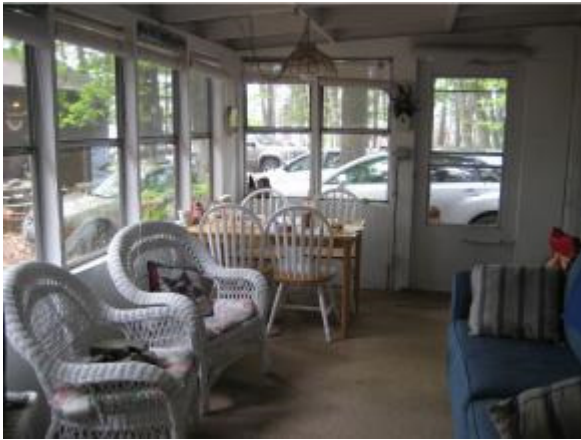
Room for Family & Friends