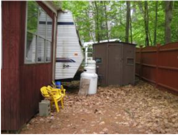
small shed included