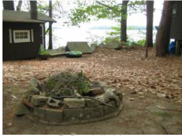
Fire Pit over-looking Lake