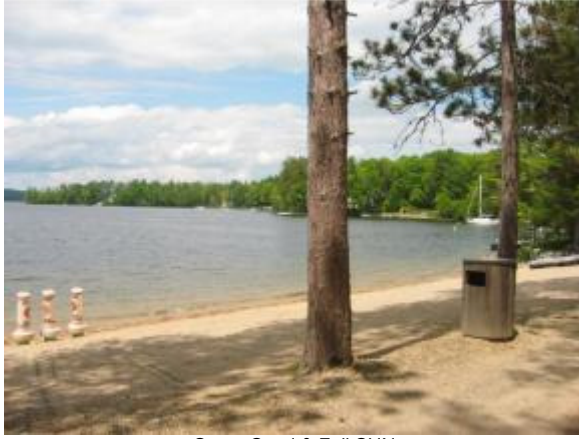
Sugar Sand & Full SUN