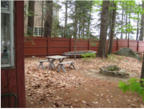
spacious yard on lake side