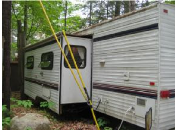
side of 29' c2001 RV