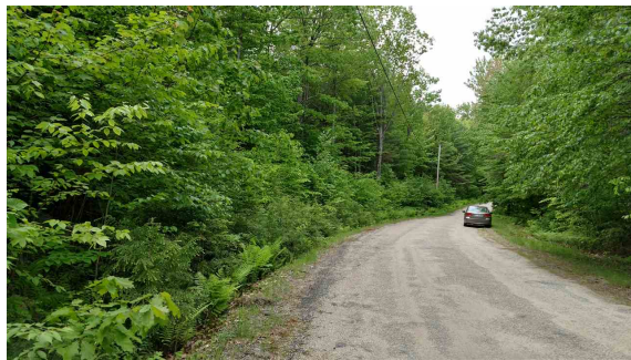
264' of frontage, pole to pole