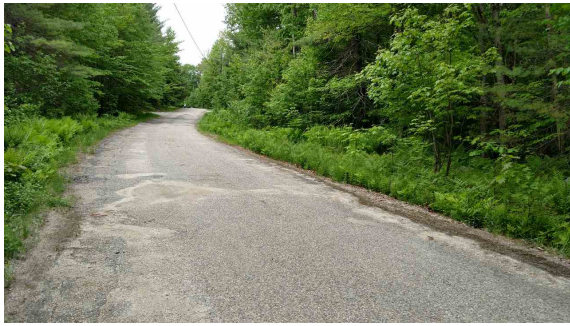
Lot on Left/Uphill side