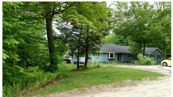
Nearest across-road home