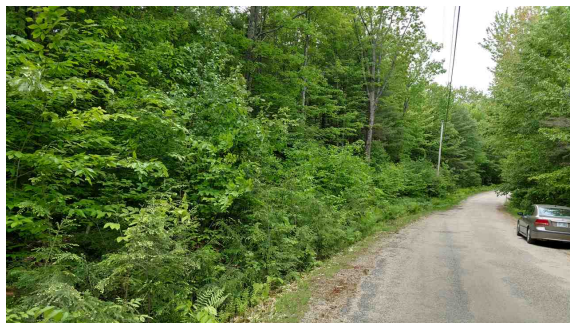
Several mature hardwoods