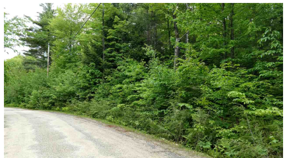
Lot on R, pole to pole