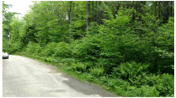
Frontage on R, pole to pole