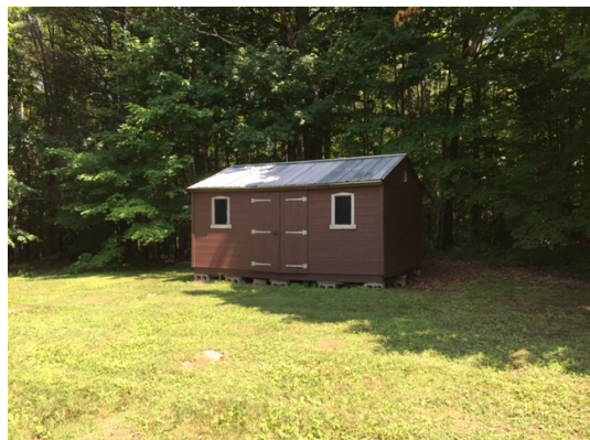
Large Garden Shed