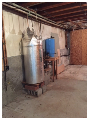
Electric HW Heater