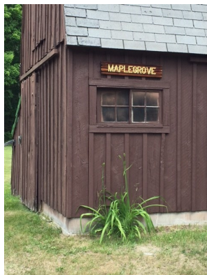
Maple Grove Farm