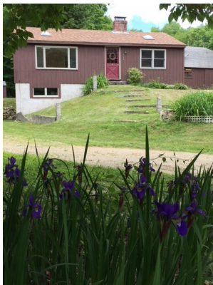
View from Street