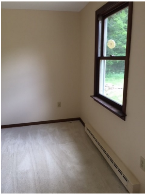
Guest Rm. or Office