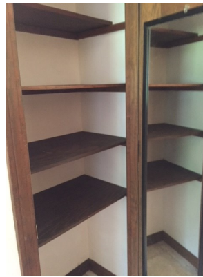
Full Bath/Linen Closet