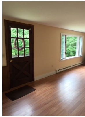
Front entrance into Living Rm