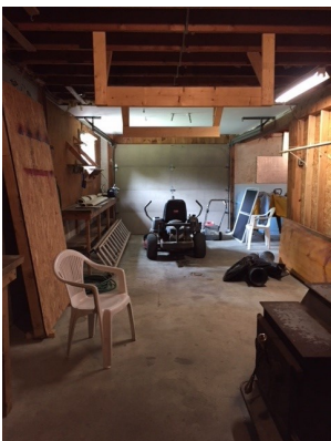
Full Basement with Garage