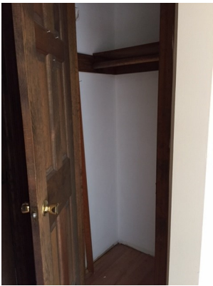
Coat Closet off Lv. Rm.