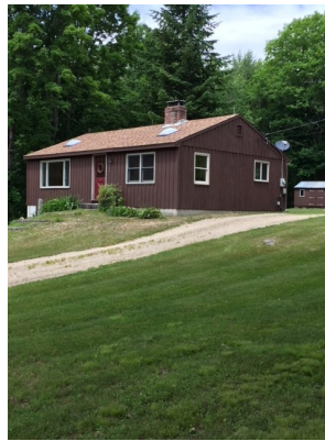
Upper Driveway to Barn