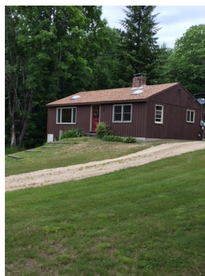
Street View from West side of the property

Subject to errors, omissions, prior sale, change or withdrawal without notice. Users are advised to independently verify all information. The agency referenced may or may not be the listing agency for this property. NEREN is not the source of information presented in this listing. Copyright 2018 New England Real Estate Network, Inc.