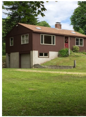
View from lower Driveway