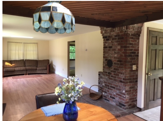
View from Dn.Rm. to Hearth