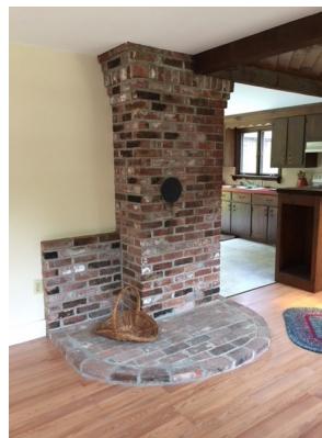
Hearth/Wood stove Hook-Up