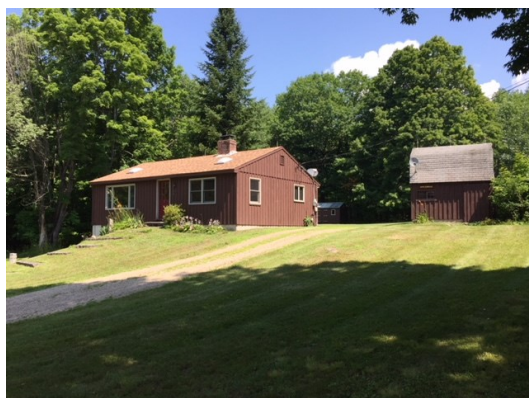
Side Lawn, Upper Driveway