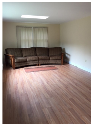
Large Living Rm.

Subject to errors, omissions, prior sale, change or withdrawal without notice. Users are advised to independently verify all information. The agency referenced may or may not be the listing agency for this property. NEREN is not the source of information presented in this listing. Copyright 2018 New England Real Estate Network, Inc.