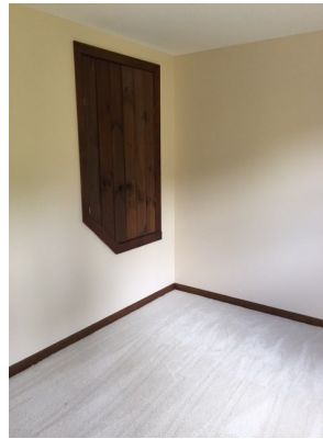
Sm. Guest Rm or Office