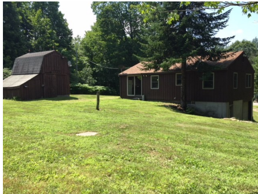
Back Yard and Barn