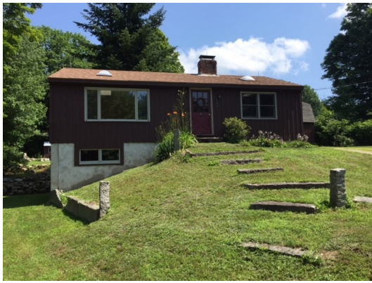
126 Stoneham Road