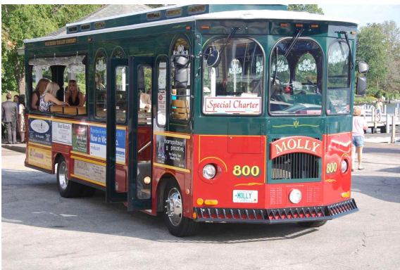
Molly the Trolley