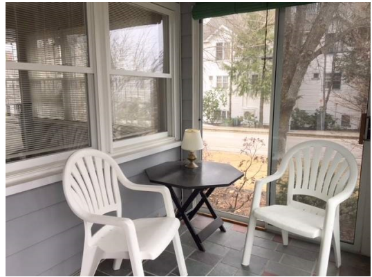
Sweet screen porch