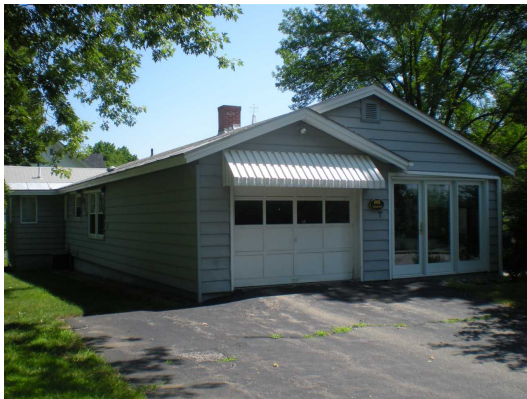
One car attached garage