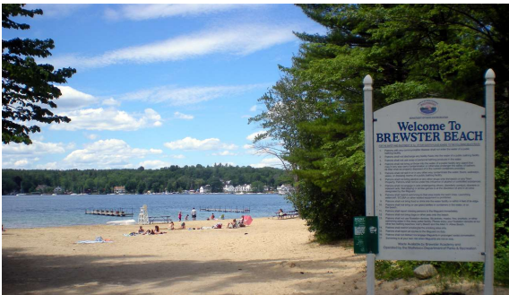
Brewster Beach near by