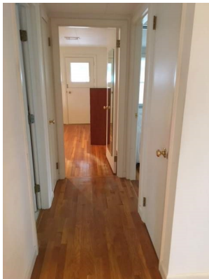
Bedroom bath hallway