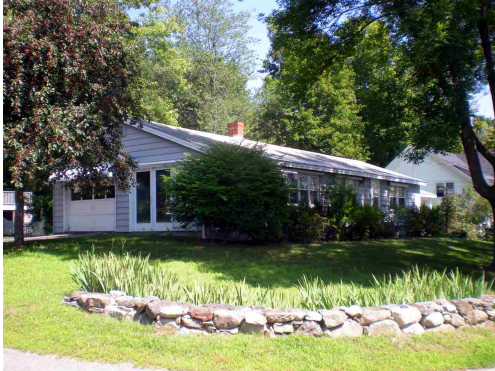
Property Panorama VT URL

Price - List $229,000 Price - Closed $234,100 Date - Closed 4/6/2018