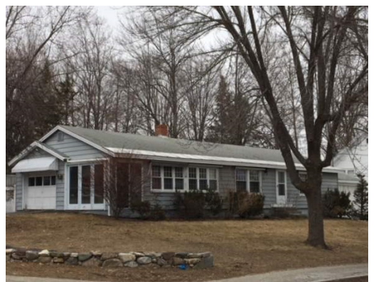
Pretty curb appeal