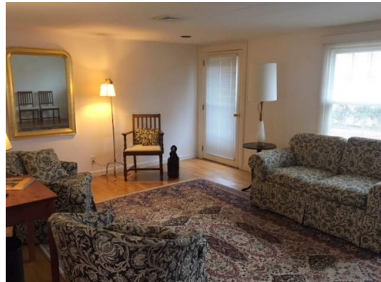
Lots of window and light