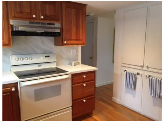
Handy built ins