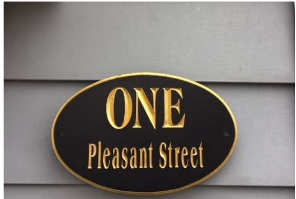
One Pleasant Street Preferred Residential Area