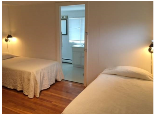
Bedroom with 3/4 bath