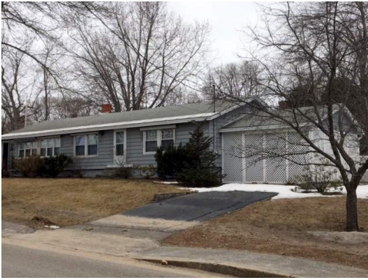
View of home along Sewall Road