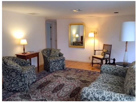
Livingroom looking to bedroom hallway