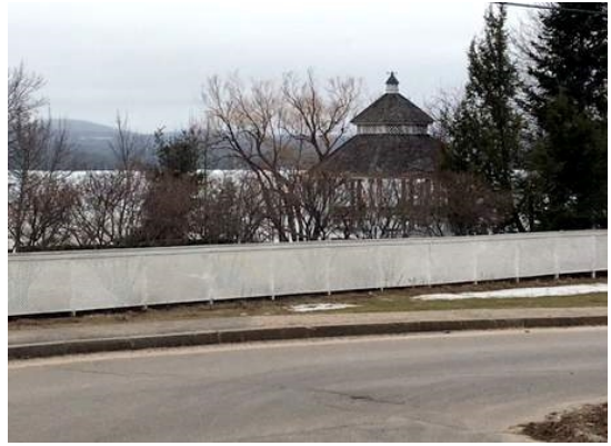
View looking towards lake