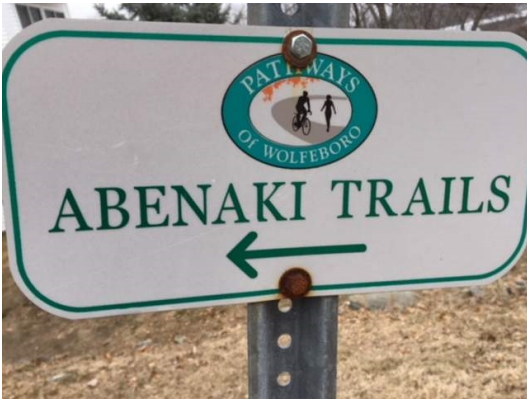
Cross country trails down the street