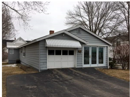
Direct entry garage