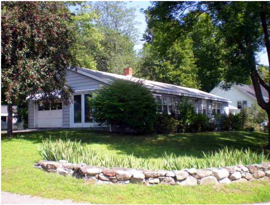
One Pleasant Street