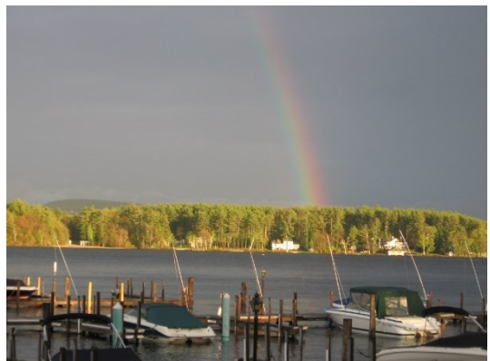
Rainbow over the Bay