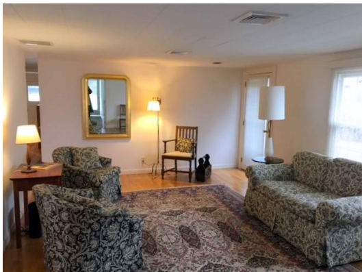
Good sized living room