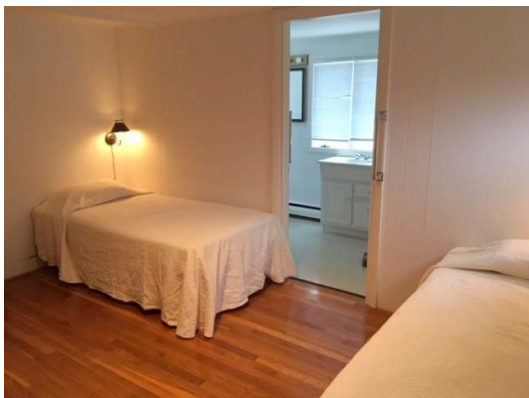
Gorgeous hardwood floors