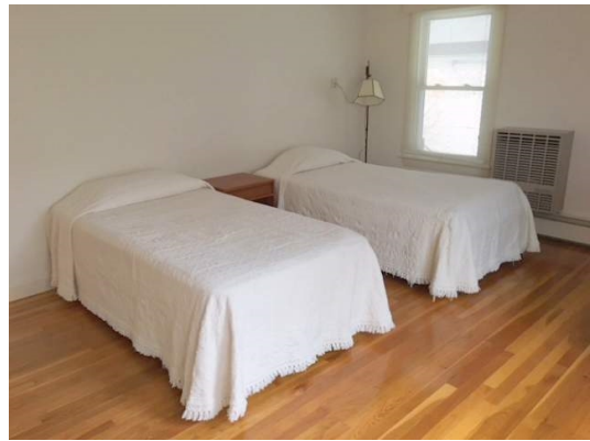
Beautiful hardwood floors