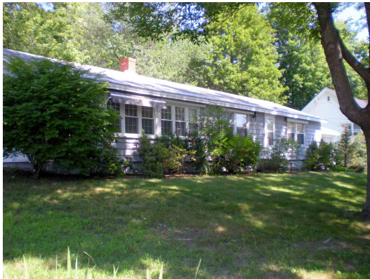
Sewall Road side