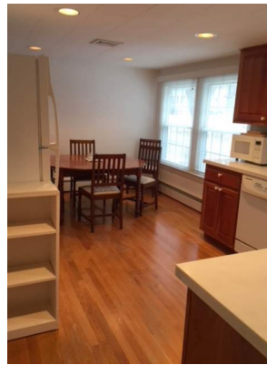
View across kitchen to dining