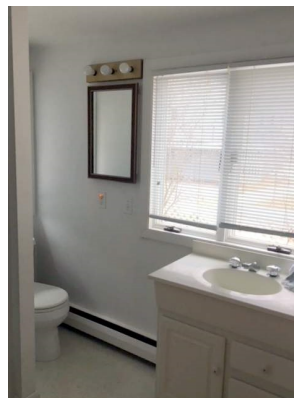
Bath with shower and walk in closet