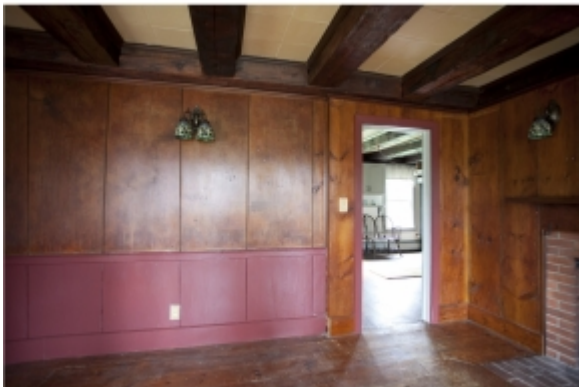
Original Wide Pine Paneling