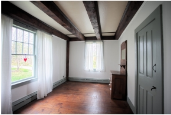
First Floor Bedroom