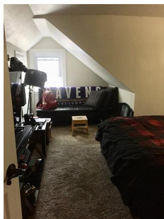
1st BdRm. upstairs

Subject to errors, omissions, prior sale, change or withdrawal without notice. Users are advised to independently verify all information. The agency referenced may or may not be the listing agency for this property. NEREN is not the source of information presented in this listing. Copyright 2021 New England Real Estate Network.