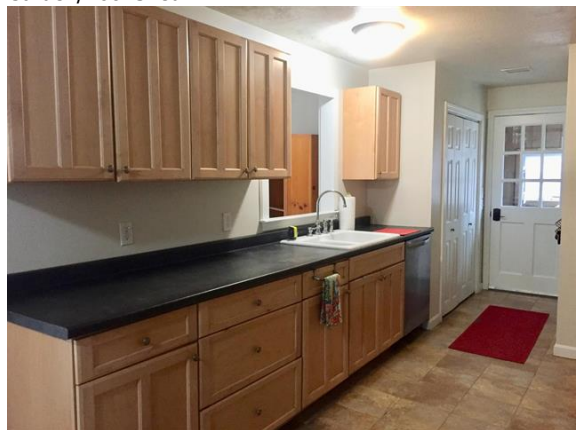
Lots of Cabinetry