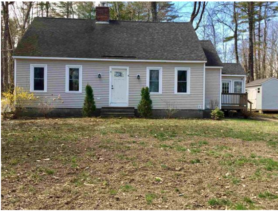
Classic Cape Style