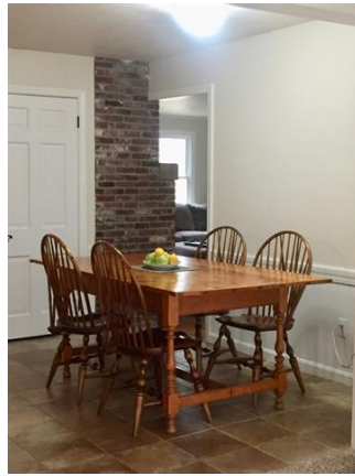
Dining area seats 8 comfortably