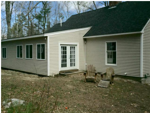
Back of the house