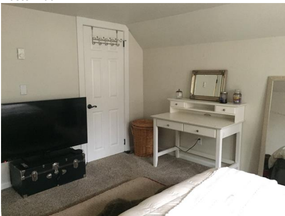
2nd BdRm upstairs