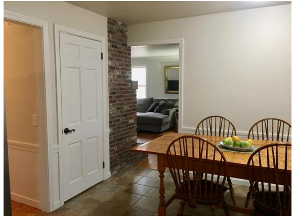
View to Living Rm.