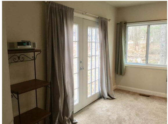
Slider from Family Rm.