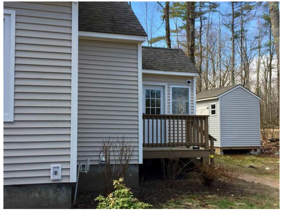
Side of Home