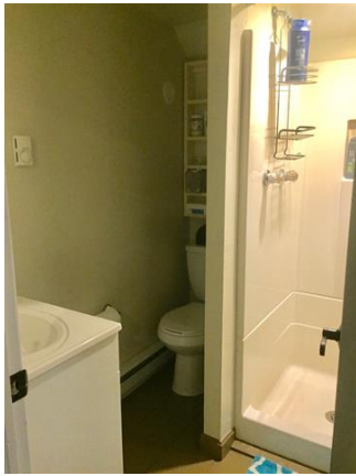
3/4 Bath 2nd floor