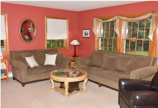
Large 1st Floor Family Room