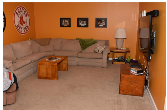
Finished Lower Level "Mancave"