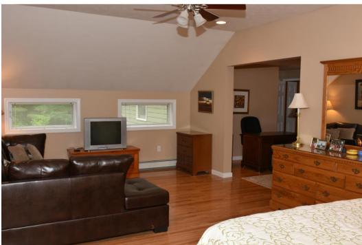
Large Master Suite