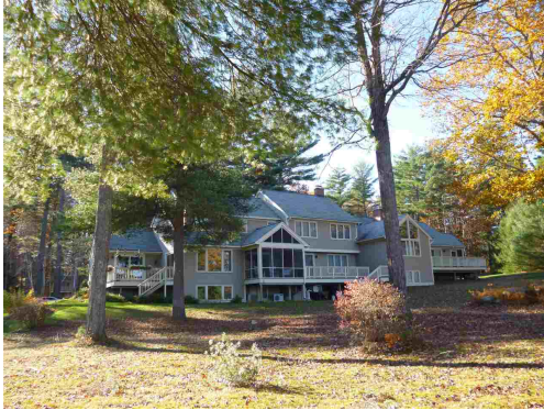
Property Panorama VT URL

Price - List $549,000 Price - Closed $549,000 Date - Closed 4/30/2018