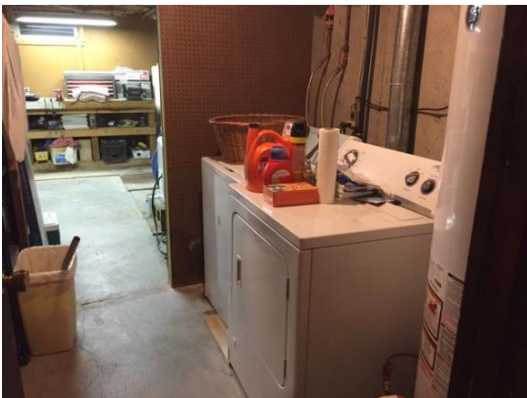
Laundry w/propane Dryer