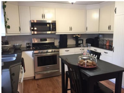
...and Newer Appliances