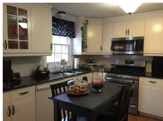
Kitchen w/Soft-Close Drawers