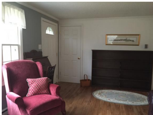
New Hardwood Floors.