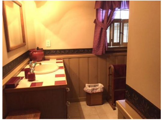
Up-dated 2nd Floor Bath