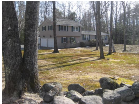
Stonewalled & Well-Treed Lot