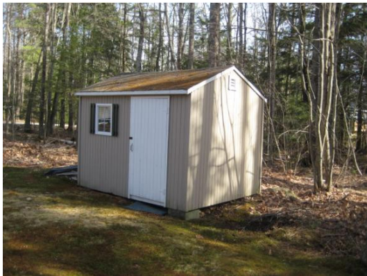
1st of 2 detached Sheds