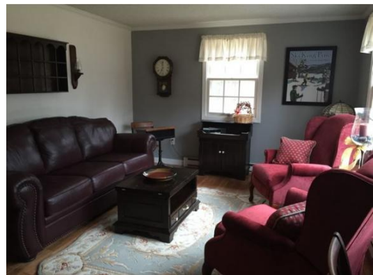
Relaxing Living Room