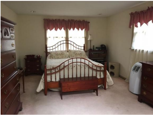
21' x 11' Master Bedroom