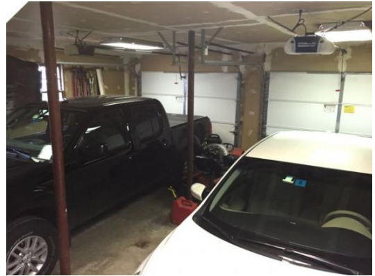
Attached 2-car Garage