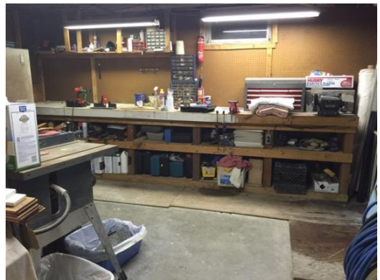
Workshop w/stairs to backyard