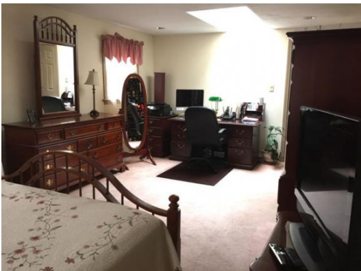
Master Bedroom w/"office"