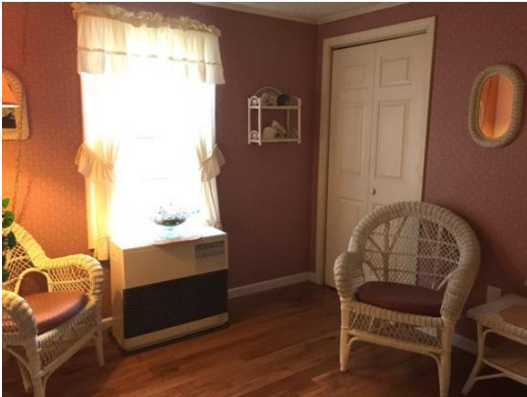
Monitor Heat cheaper than Elec