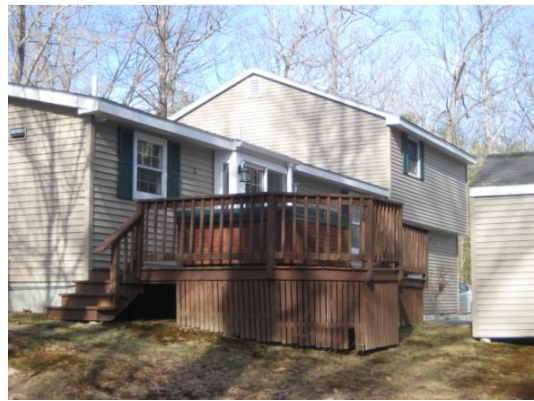
Working Hot Tub included