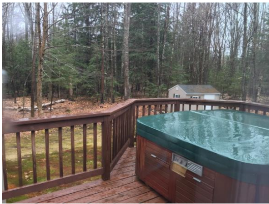
...to the large Private Deck