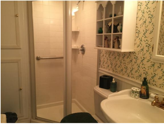
Up-dated 1st Floor Bath