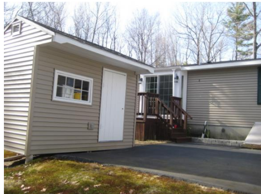
2nd detached Shed