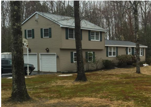
Auto-Open Doors to Garage