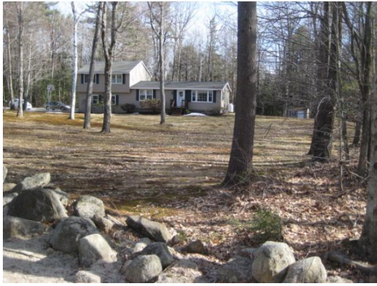
Spacious Level Yard