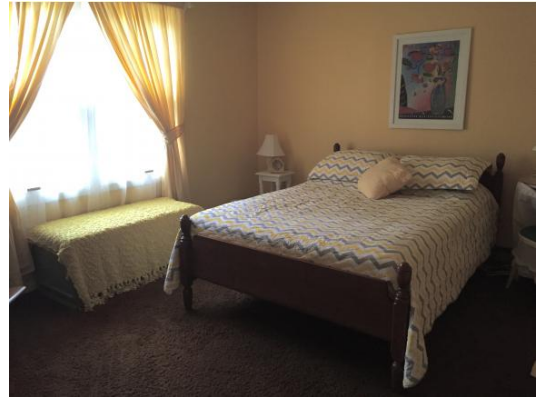
13' x 11' 1st Floor Bedroom