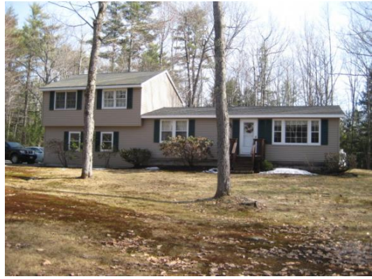
Newer Roof Shingles & Siding.