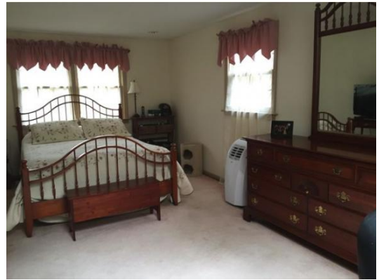
w/4 Windows & newer A/C unit