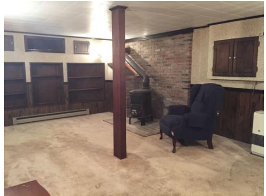
Large lower-level Family Room