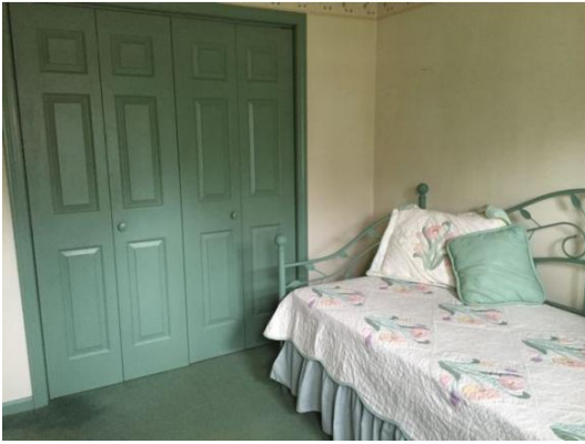
Lots of Closets throughout