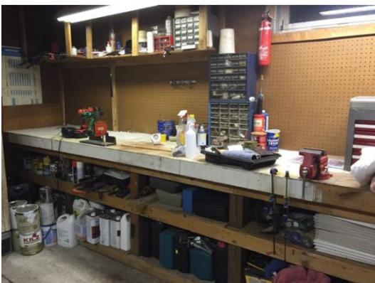
Large Bench in Workshop