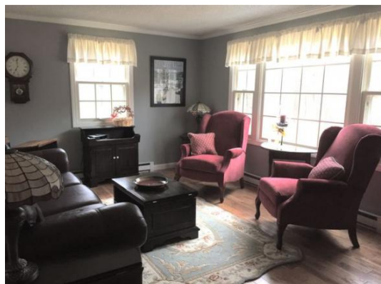
Large Sunny Living Room