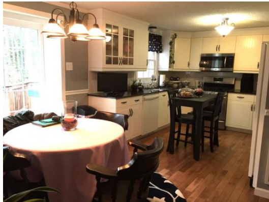
Dining Area Opens onto Deck