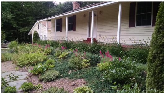
1 floor living w/att'd garage