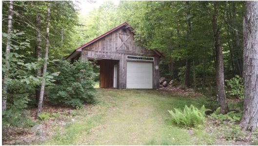
separate drive-thru barn