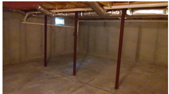
spacious & DRY basement