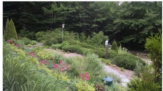
from 48' wide open porch