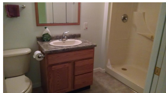
master bath w/step-in shower