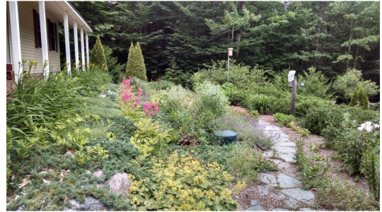
buried propane tank