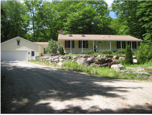
modern comforts on 86 Acres!