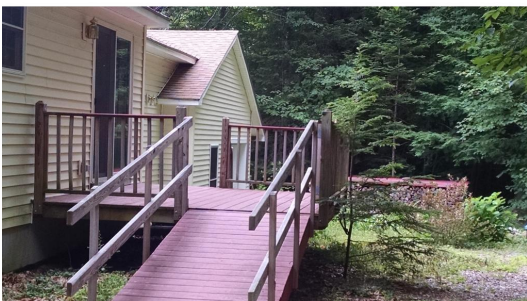
expandable & sunny Deck