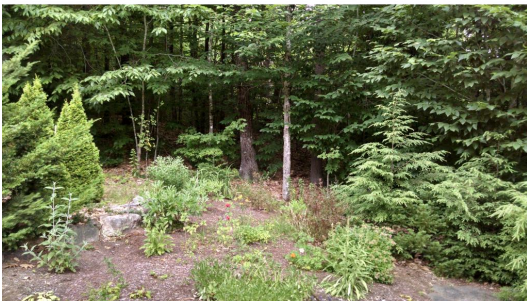
4 + 82 acres of privacy