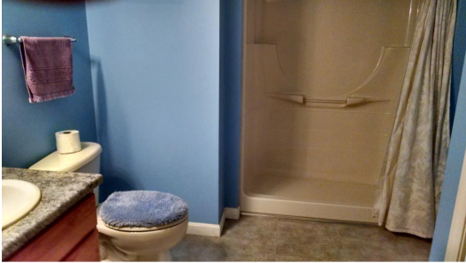
guest bath w/step-in shower