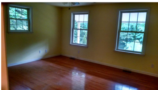
master bedroom w/own bath