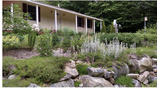
easy to maintain gardens