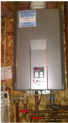
efficient instant-on hot water