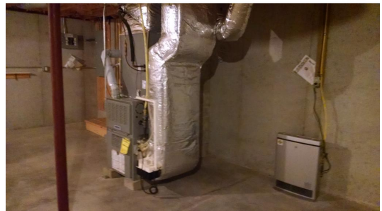
FHA heat w/full-house AC