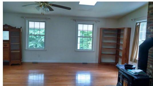
open living area w/woodstove