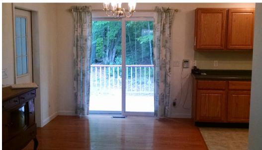
dining area to sunny back deck