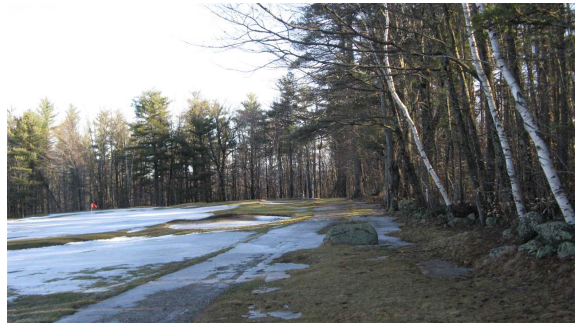
Another left Boundary View