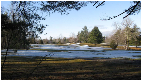
Views to the South as you walk on McManus Road