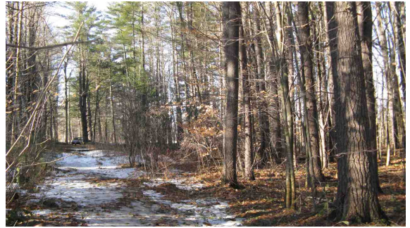
Interior Woods Road Looking South