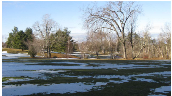
Southwest Open Views