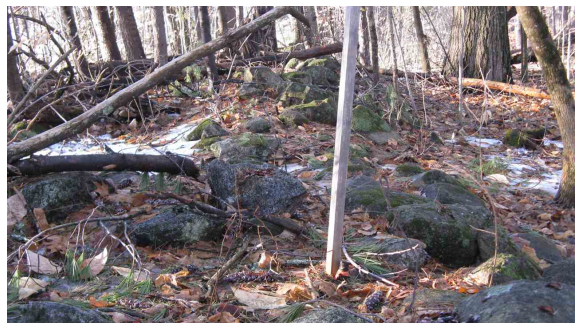
Northeast Corner Pin with Flagging