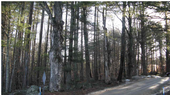
McManus Road Crosses in Front