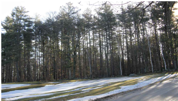
Mature Pine Growth on this Wooded 1-Acre Lot