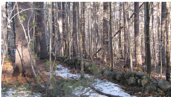
Back Stonewall Boundary