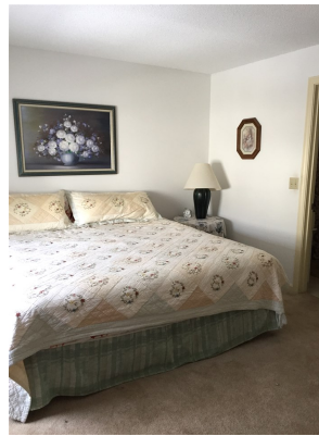
Very Lg. Master BdRm.