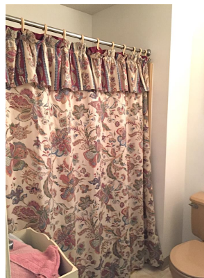
Tub with Shower

Subject to errors, omissions, prior sale, change or withdrawal without notice. Users are advised to independently verify all information. The agency referenced may or may not be the listing agency for this property. NEREN is not the source of information presented in this listing. Copyright 2017 New England Real Estate Network, Inc.