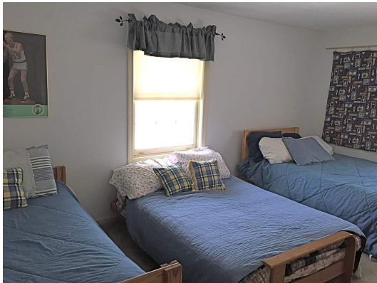
Or Room for Friends