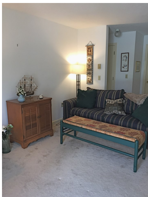
Walk in Storage Closet