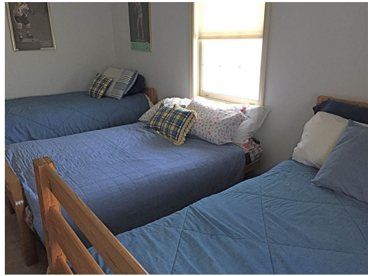
Room for Family