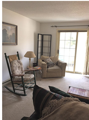
View from Entry toward Deck