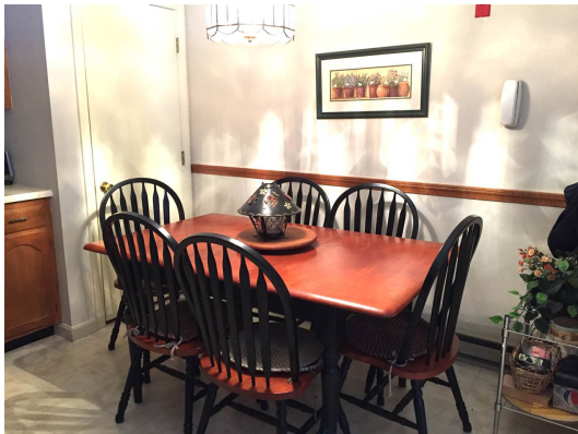
Nice Dining Area