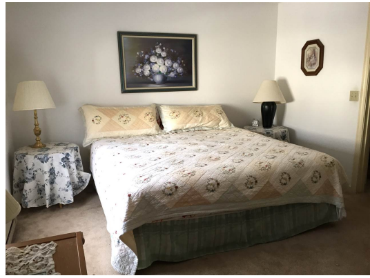
En Suite Mstr. BdRm.