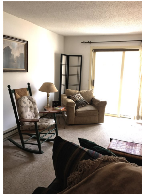
View from Hallway