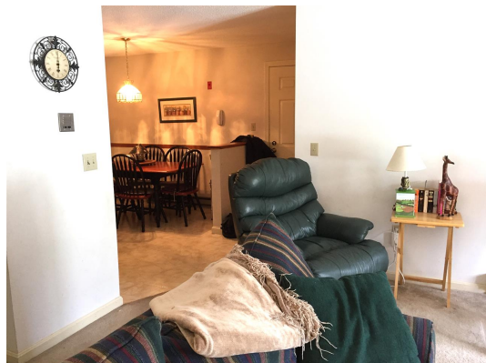
View back to Kitchen/Dining Area