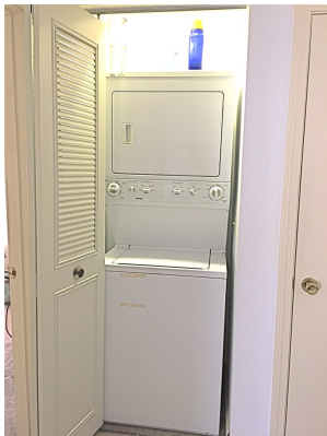
Your own Washer/Dryer