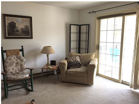
Large Living Rm.