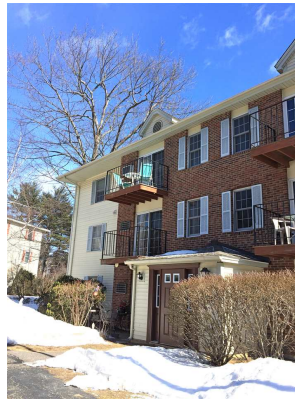
Convenient to Weirs Beach