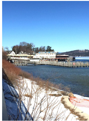
The Docks at Weirs Beach