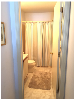
2nd Full Bath