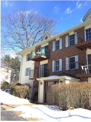
End Unit - Bldg. #3