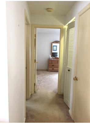
Extra Closet Space