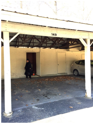
Covered Parking &amp; Storage