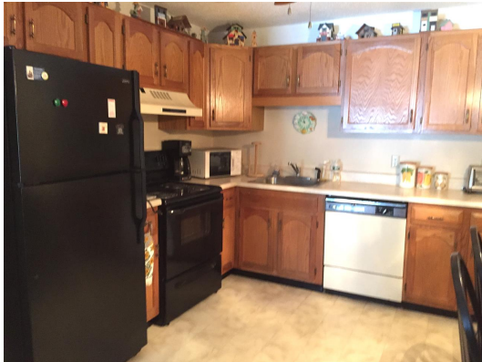
Lots of Cupboard Space