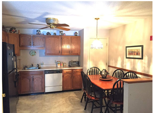
Lg. Pantry Closet