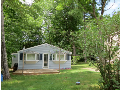
Property Panorama VT URL

Price - List $149,000 Price - Closed $140,050 Date - Closed 8/18/2017