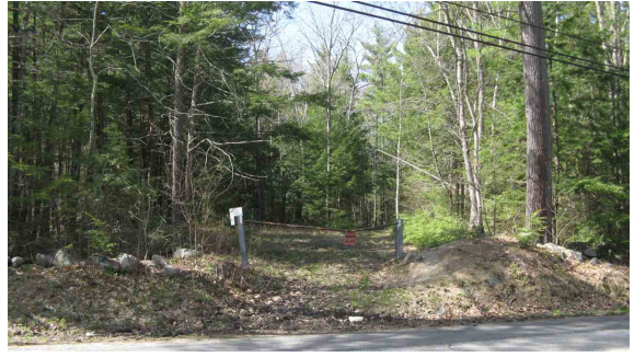
Logging Road Trail off Pleasant Valley Road