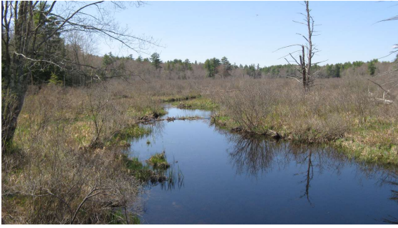
Heath Brook Passes under Pleasant Valley Road