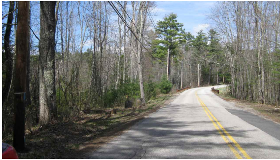
991' frontage on Paved town Road close to Kingswood