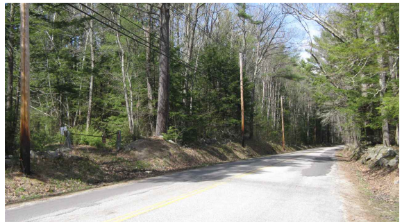
Create a well-managed forest