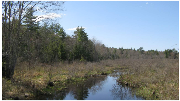
24 Acres of Wetland through the Heath abutting 86 acres of forest